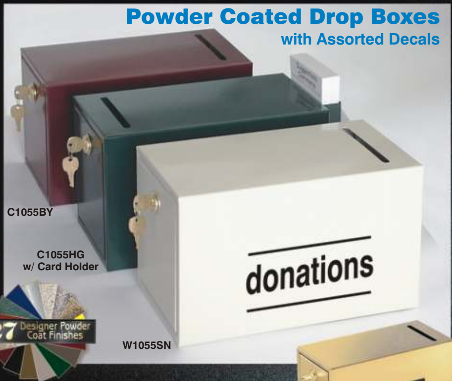
Powder Coated Drop Boxes with Assorted Decals

Glaro drop boxes provide an elegant, effective and secure solution for the collection of keys, suggestion cards, express check out forms, mail and donations. There are numerous other custom applications as well. Place drop boxes at any convenient location and know that they will be used. The contents can be retrieved at any convenient time, but only by authorized people. All boxes have a security lock with two keys and are available as wall mounted, counter mounted and floor standing models. Every model provides more than 500 cubic inch capacity.