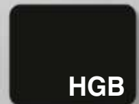
High Gloss Black